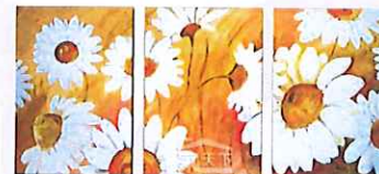
INTERIOR DECORATIVE PICTURE