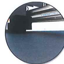
5.High precision platform with suction