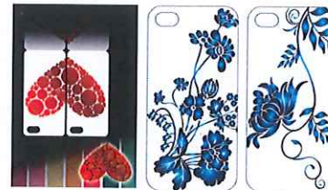
MOBILE PHONE COVER