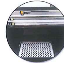
2.PH Cleaning station