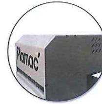
1.Negative pressure system