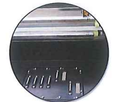
3.PH capping system