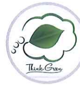
LED UV curing system