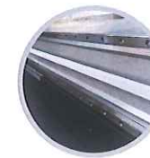
THK linear guide