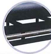
Airshaft for media feeding & taking up