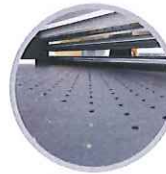
High quality conveyor belt to avoid media wrinkle&deviation