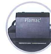
Big printhead carriage