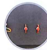
Suction control devices