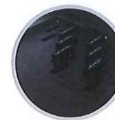
Print head capping devices