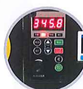
Frequency flow suction