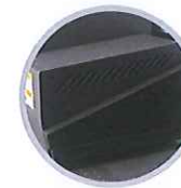
Printhead anti-crash system