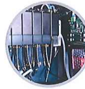
Electronic magnetic valve