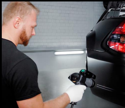
Hot air and temperature measurement with one hand while car wrapping.