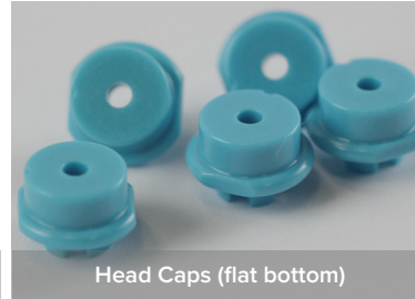
Head Caps (flat bottom)