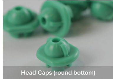
Head Caps (round bottom)